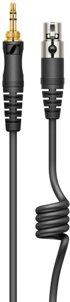
A Sennheiser patent: The coiled part near the earcup connector prevents cable noise from reaching the earcups

To adapt to different set-ups, the detachable cable can be worn on the left or right side of the HD 480 PRO. This flexible cable routing is ideal for solo recording of instruments, for example, as it keeps the cable out of the way. To ensure accessibility, the left and right earcups are braille-marked. Engineered by Sennheiser's experienced professional development team, the HD 480 PRO have been designed to last and deliver consistent results over time.